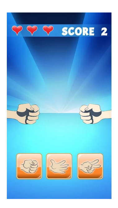
Rock, Paper Scissor - For minigame part