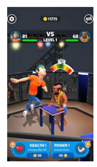
Slap king - For slapping part